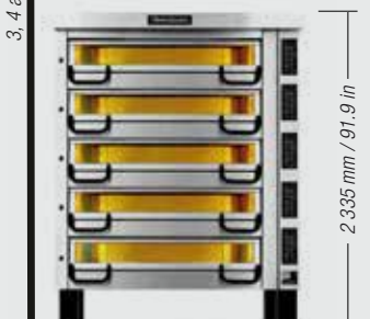
PM 915 / 925 / 935 / 945