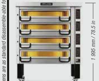
PM 914 / 924 / 934 / 944